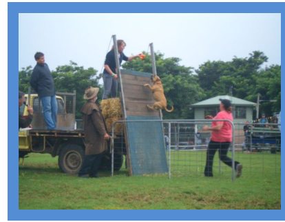
Chelsea – The Jumping Dog