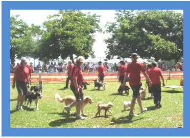
Obedience Demo Team