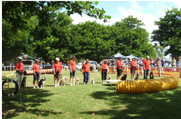
The demo team