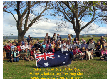
International Day of the Dog Milton Ulladulla Dog Training Club NSW Australia - 30 April 2006