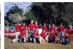
Demo Team 2006