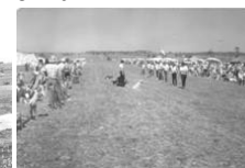
Crooybar Cup 1981