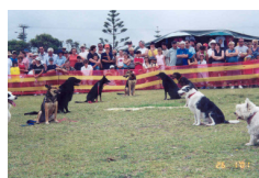
Demo Team 2001