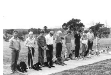
Venue Milton School 1980