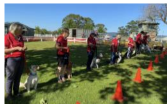
Demo Team - Fun Day in December 2022

After 8 February we will update our email listing